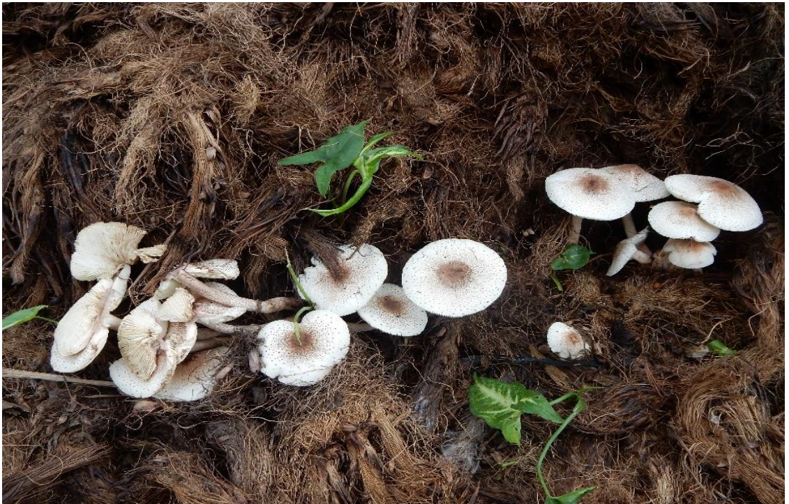
Figure 1 : Leucoagaricus cf. americanus (Peck) Vellinga (2000), (YIAN171) ; N 5°18'44.8", W3°48'3.4"