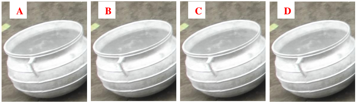
Figure 1: Sample of local kitchen utensil.