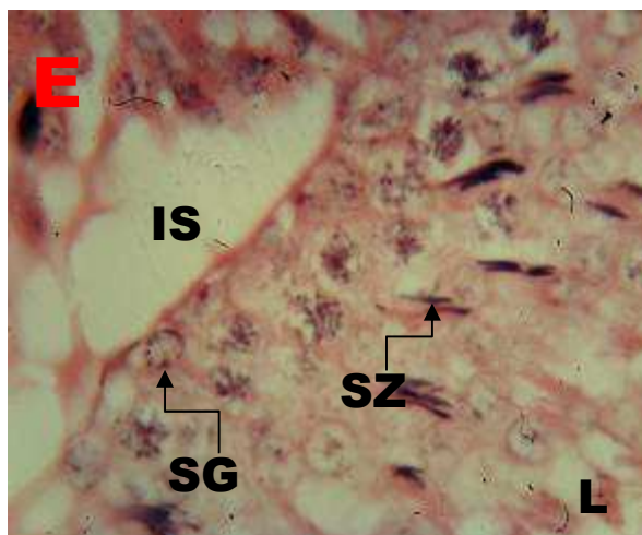
Figure 1: Photomicrograph of part of the seminiferous tubules with spermatogenic cells at different stages of development. (SG- spermatogonia, SC- spermatocytes, ST- spermatids, SZ-spermatozoa); the lumen (L) contains mature sperm cells. Compared to the Control (A), treatment groups had a reduction in the population of sperm cells and staining intensity was reduced (B-E); these changes appeared more in Group D that received the higher dose of AZA only; LP= lamina propria. H&E \times 1000 . [A- Control; B-10 mg/kg of AZA; C- 10 mg/kg AZA and 25 mg/kg ascorbic acid; D- 20 mg/kg AZA; E- 20 mg/kg AZA and 50 mg/kg of ascorbic acid].