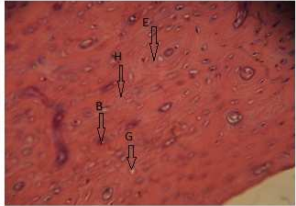
Plate 1: Compact Bone Section (5% GS at 300C; H&E x400) presents the best histological features that are distinct with very good staining quality showing matured osteon with haversian canal, osteocyte and blood vessels (A) as well as Young osteon (B), resolving osteon (C), Volkman's canal (D), osteon lamella (E), lacunae containing osteocyte and empty space occupied with extracellular fluids (F), empty lacunae (G) and cement lines (H). Each of the features are indicated with arrow