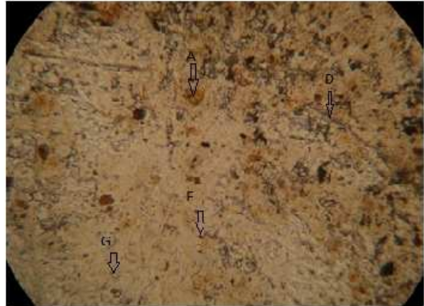
Plate 2: Compact Bone Section (5% GS at 400C; H&E x400) presents normal histological features that distinct with poor staining quality.