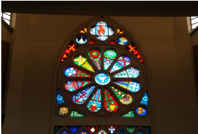
Fig. 3: Stained glass painting (detail of upper section), St Dominic's Catholic Church, Yaba, Lagos, Yusuf Grillo, Plexiglass & Pigment, 1963.