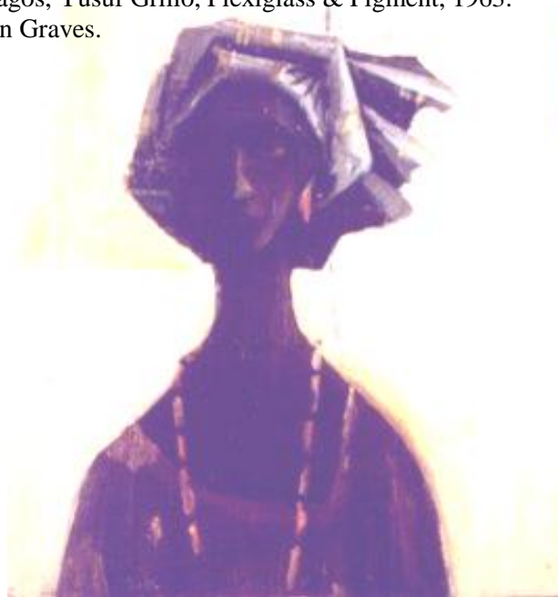
Fig. 4: Yoruba Bride , Yusuf Grillo, © National Gallery of Art, Abuja.