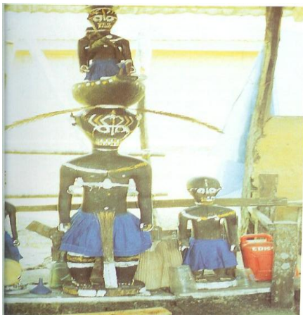
Plate 3: Edisibowei (1978)