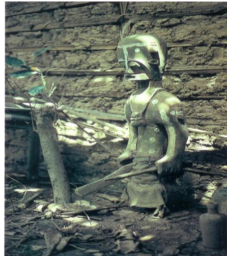
Plate 2: Osuwowei (1979)