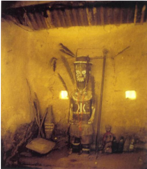
Plate 1: Isobowei (1978)