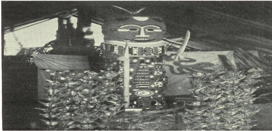
Plate 5: ‘Opu-Adumu’ Kula-Village

Apart from the images in human figures, which have the characteristics of African art style, the Ijo are known for their horizontal headpieces. These types of masks are more commonly fashioned, designed, or created by the Ijo tribe than any other tribe. There is no noticed influence from any region. These headpieces are carried on top of the head instead of covering the face as most conventional masks which signifies the spirit’s rhythmic movement – floating on the surface of the water and or fishes’ movement against the current or with it showing various activities of their life style. The costume the masqueraders wear also suggest the idea that spirit beings have come out of the water to play. There are also water spirits represented in anthropomorphic features.