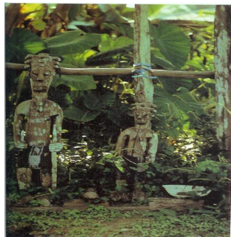
Plate 4: Edewei (1978)