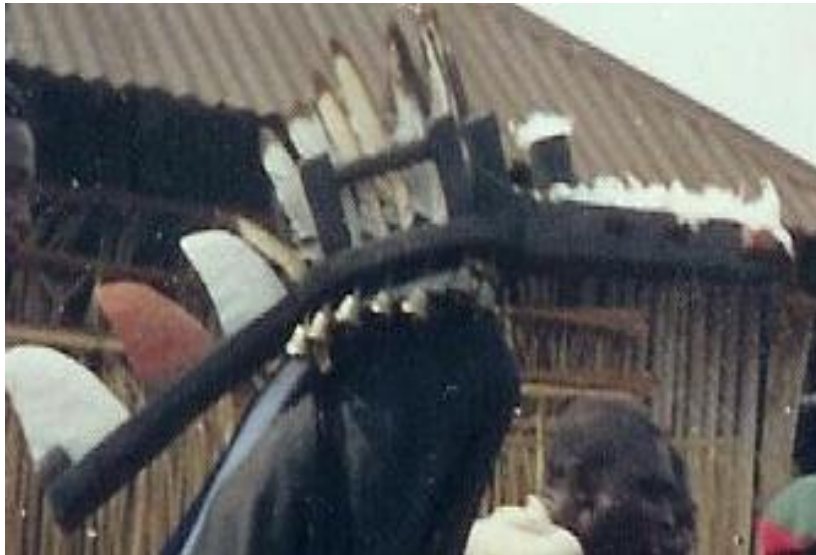
Plate 8: 'Ugonzu Mask'

Courtesy: Kalabari Sculpture: Robin Horton - 1965