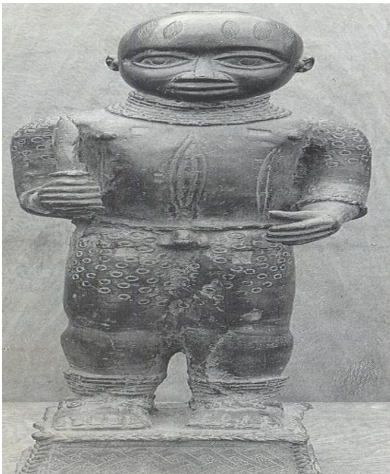
Fig. 1: A Brass Image of Ise ne Utekon

Another commemorated incident also involving Oba Ozolua is the conflict between him and Egbaen, the powerful ruler of Iwu, a town in Benin. Oral history reports that during one of their conflicts the rebel ruler captured the Oba and imprisoned him.