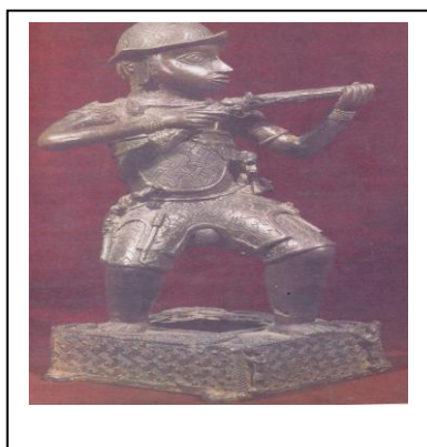
Fig.2 Portuguese Warrior

Portugal read in part, “the missionaries went with the King of Benin to war and remained a whole year; the King could not do anything until the war was over” (qtd. Egharevba: Ibid). The Obas also personally participated in the wars and commanded the Benin Army until Benin military commanders abolished the Oba’s right to command during the reign of Oba Ehengbuda in late sixteenth century (Duchateau, 1993). The life and war exploits of Benin Kings are dominant themes in Benin commemorative art. Some well-documented examples are the war escapades of the Obas of the fifteenth and sixteenth centuries whose main focus was on the expansion and defense of Benin kingdom. Notable amongst these are the wars fought by Oba Esigie (1504) as exemplified in the legendary battle against the Attah of Igala, North of Benin. Themes that immortalize these wars, and which proclaim the military might of Benin Obas and their Army include: Benin kings and warrior chiefs in battle gears wielding long cutlasses or swords ( Umozo ), spears ( Ogan ), and bows and poisoned arrows. There are also figures of the Portuguese mercenaries who aided them in some of their battles who are depicted dressed in European clothing and holding European weapons (Fig.2). Generally, these artforms evoke and immortalize Oba Esigie’s battle victories, and on a broader level, those of other Benin Kings. They underscore the martial might of Benin Kings and are meant to deter political revolts against the Oba.