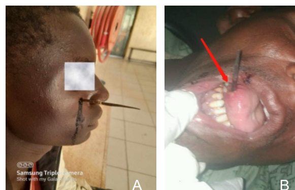
Figure 1a: Show arrow injury on the right part of the face with the trickling of blood for the first case presentation. 1b: Figure showing the injury on the right orofacial region of the second case as indicated by the arrow

This case report was conducted in compliance with the guidelines of the Helsinki declaration on biomedical research in human subjects. Consents were obtained from the patients involved in the two cases