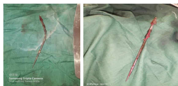
Figure 3. The arrow that were removed for the first(a) case and (b) second case