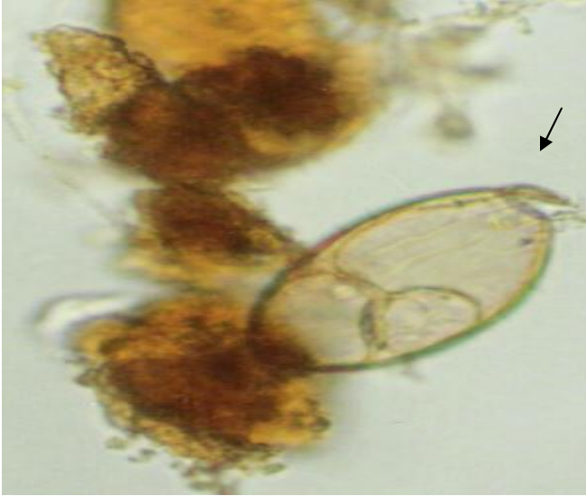
Figure 3. The egg which already hatched out operculum open (Arrow)