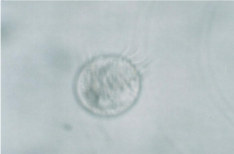
Figure 4. Hatched coracidia with cilia on the body surface