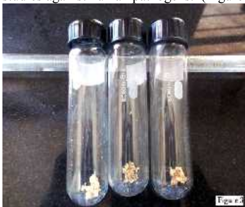
Figure 3: Isolated Protein of THB strain

The mass cultivated broth was filtered by using filter paper. 300ml of filtrate was mixed with 300ml of ethyl acetate in a separating funnel to extract bioactive compounds. After removing the lower aqueous phase, the upper solvent phase was concentrated in a vacuum evaporator at room temperature for 24 hours and a crude extract was obtained. This crude extract was used for further secondary screening studies against human pathogens. (Figure 3)