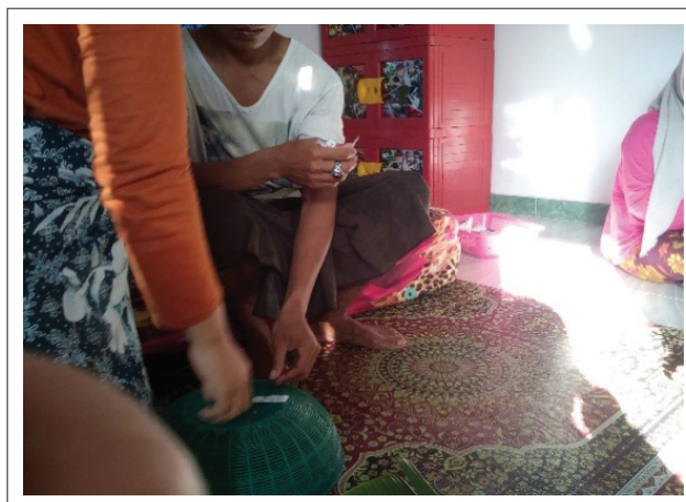
FIGURE 5: Face washing.