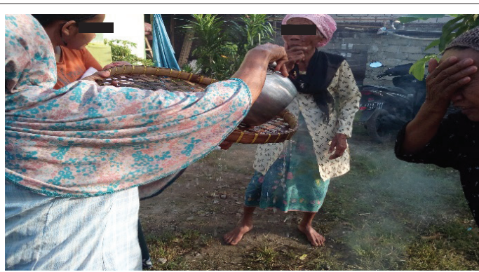
Source: Photographs taken by the author, 12 November 2020, in Batujai, Central Lombok, Indonesia