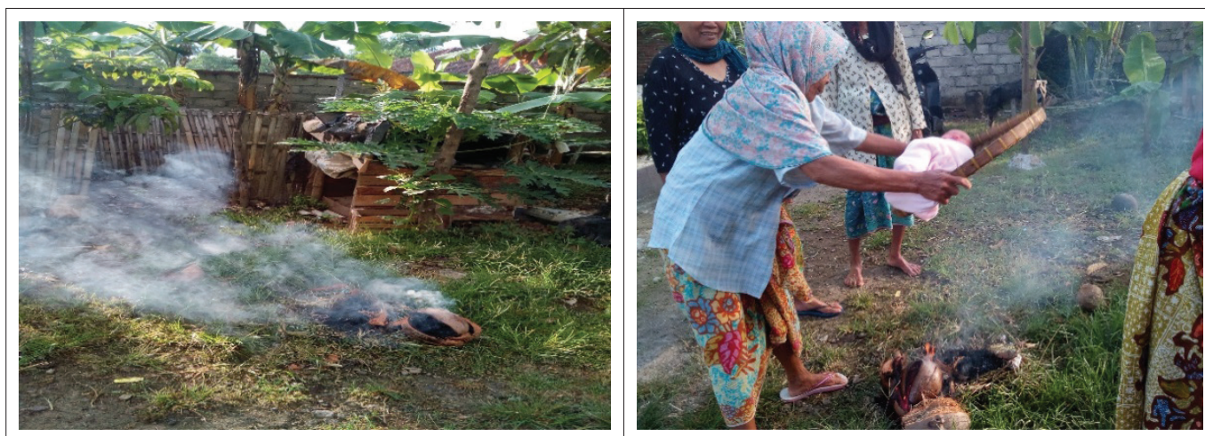
FIGURE 3: Baby bathing process and fumigation process.