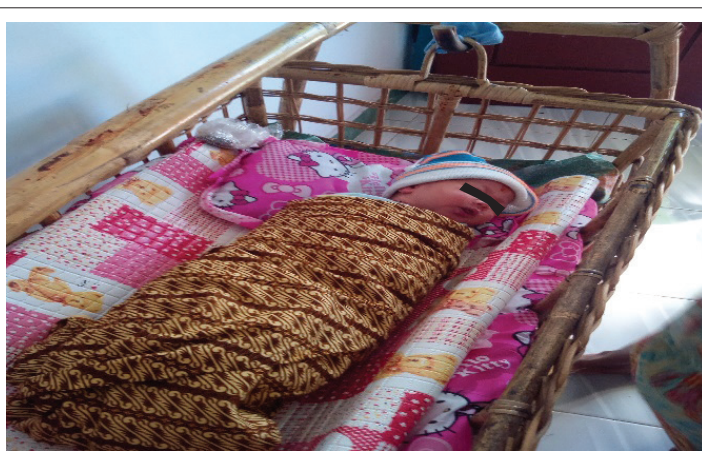
12 November 2020, in Batujai, Central Lombok, Indonesia