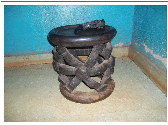
FIGURE 2: Ancestral stool for the king.

Source: Photo taken by Mathias A. Fubah, Grassi Museum Leipzig, June 2014 2