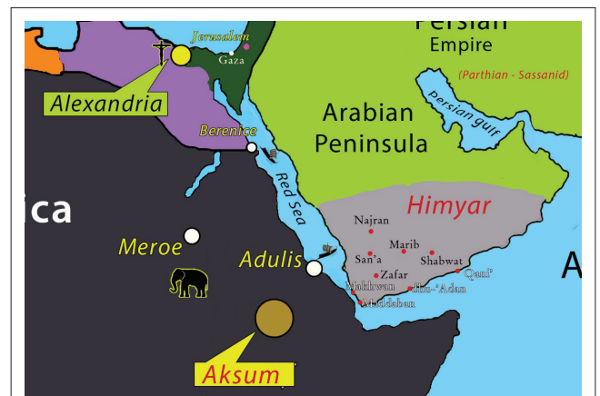
Figure 2 is a zoomed excerpt of the same map that focusses on the Horn and the Arabian Peninsula.

Source: Adapted from Bowersock, G.W., 2013, The throne of adulis: Red Sea wars on the eve of Islam , Oxford University Press, New York, NY