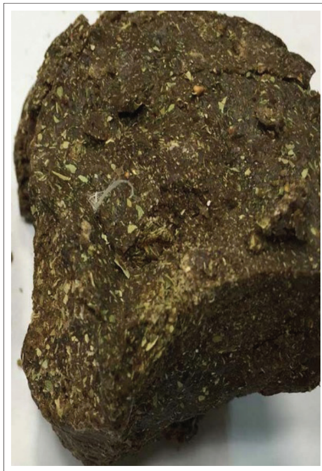
Source: Samsam Sanei, n.d., (صمصام صناعی), خواص درمانی آن (صمصام صناعی), viewed 20 January 2021, from https://rasekhoon.net/article/show/1372764

Ziarati and Hochwimmer (2018:1–9) describes the Taranjebin as 'semi liquid resinous sweet substance that exudes onto the leaves and branches [...] [and] hardens into white