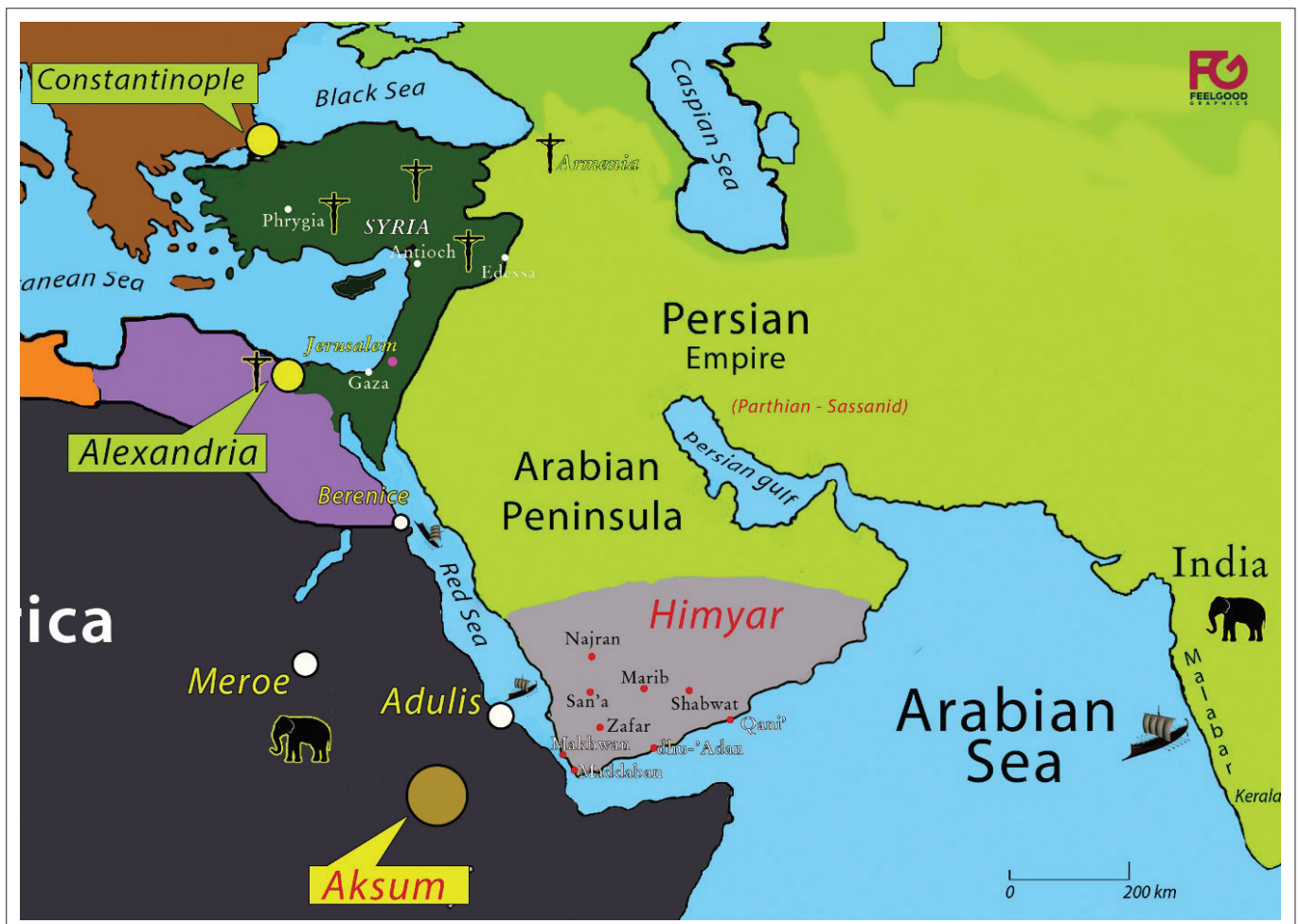
FIGURE 2: The Battle of over Najran and its geographical context.

In reflection of the passages, the reiteration of the cross theme, it appears that this consolidates with the inscription that refers to the victory through the (masqal) cross. This may be deduced as intrinsically derived from