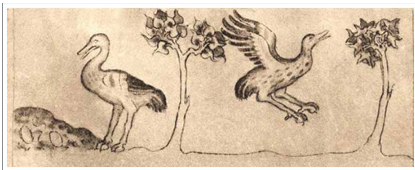
The ostrich lays its eggs on the ground. In right, it makes an attempt to fly, though it cannot

The Arab writer al-Jāhiz (الجاحظ), who lived and operated in the city of Basra in the 9th century AD (d. 869), states in his great zoological composition Kitab al-Hayawan (كتاب الحيوان 'Book of the Animals') that in Persian the name of the ostrich is shetur morg (شتر مرغ), that is, camel-fowl, but he expresses reservations in this regard and adds: