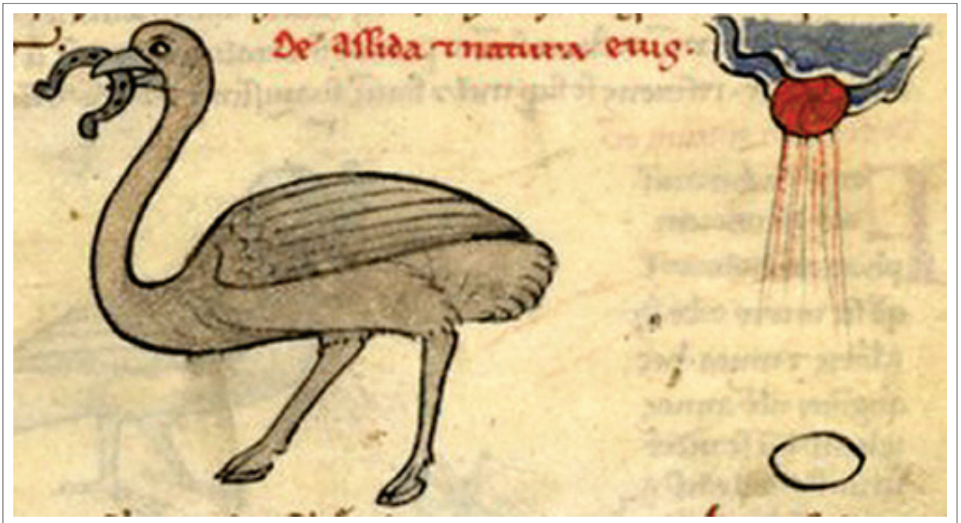
Source: The Medieval Bestiary, n.d., The ostrich eats an iron horseshoe while ignoring its egg behind it, which is being warmed by the sun , viewed n.d., from http://bestiary.ca/beasts/beastgallery238.htm# FIGURE 5: The ostrich eats an iron horseshoe while ignoring its egg behind it, which is being warmed by the sun.

Jewish sources in the middle ages and in modern times mention the unusual food of the ostrich in several contexts not mentioned in rabbinical times, for example, with regard to whether it can be eaten under Jewish standards. As stated above, the sages identified the ostrich with the bat ya'ana mentioned in the biblical list of impure birds