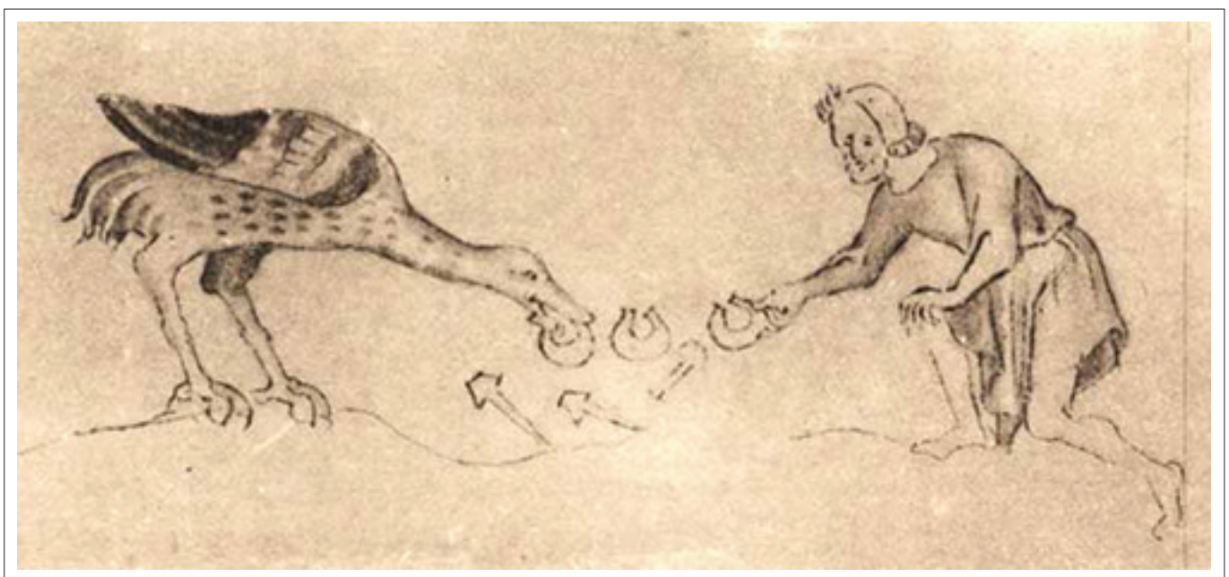
Source: The Medieval Bestiary, n.d., The ostrich has a strong stomach so it can eat iron horseshoes and nails , viewed n.d., from http://bestiary.ca/beasts/beastgallery238.htm# FIGURE 6: The ostrich has a strong stomach so it can eat iron horseshoes and nails.