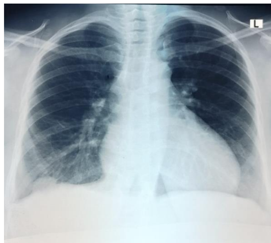
Plate 3: Chest x-ray showing full lung expansion after chest tube removal

She was managed by a multidisciplinary team of cardiothoracic surgeons and obstetricians together. A right chest tube was inserted. The patient's condition improved. The chest tube stopped bubbling after 9 days. A repeat chest x-ray confirmed full lung expansion. The chest tube was removed, and she was discharged from the hospital. She was readmitted at 38 weeks of gestational age and had an uneventful caesarean delivery. The caesarean delivery was on account of two previous myomectomies. Repeat chest x-ray and Computed Tomography (CT) scan six 6 months later were normal.