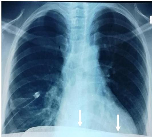
Plate 2: Chest x-ray with chest tube in-situ, with an abdominal shield (arrows)