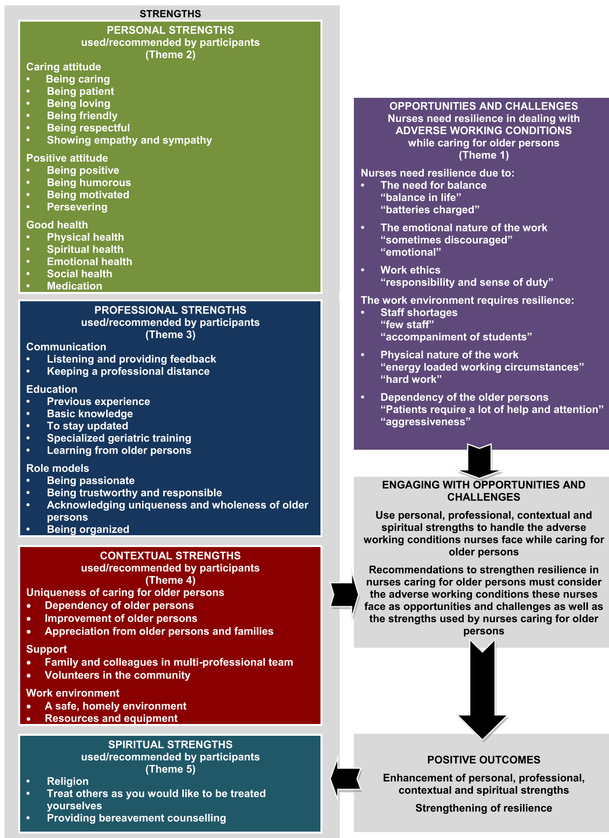
Fig. 1 – Strengths used or recommended by participants to handle the adverse working conditions they experience while caring for older persons as applied within the model “Bringing strengths to bear on opportunities and challenges” Carr (2004, p. 304), as adapted. [The model “Bringing strengths to bear on opportunities and challenges” Carr (2004, p. 304) was adapted by indicating the findings of this current study under the broad framework provided by Carr (2004, p. 304)].