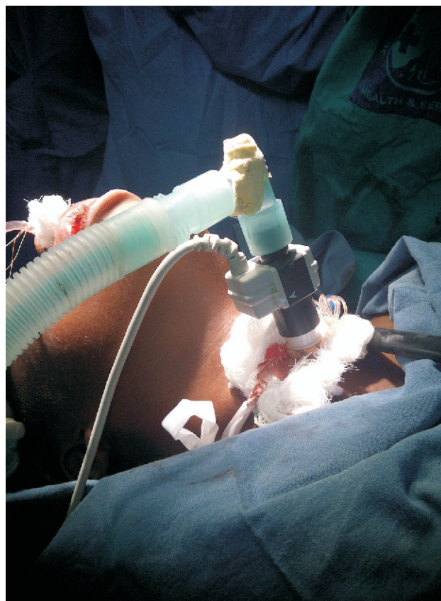
Figure 2. Tracheostomy performed for anaesthesia in a 19 year old girl with oropharyngeal stenosis following traditional uvulectomy

operative day. Otologic symptoms regressed remarkably following surgery.