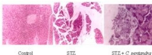
Figure 2 The effect of ethanolic bark extract of C. pentandra on STZ-induced pancreatic damage in rats

The pancreas of diabetic group (Figure 2) showed reduction in size, scarcity of cells along with degeneration and necrosis, large decrease in endocrine tissue. Partly decrease of degenerative cells and the protective effect of tissues were noticed in the C. pentandra extract treated groups.