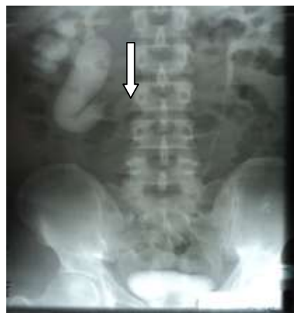
Figure 1 Intravenous pyelogram with non-visualization of right ureters (arrow)

Full blood count, urinalysis and blood urea and creatinine were normal. Abdominal ultrasonography revealed a right hydronephrosis. An intravenous pyelography showed delayed function of the right kidney and subsequently a right hydronephrosis and hydroureter of the proximal ureter with non-visualization of the rest of the right ureter. (Figure 1)