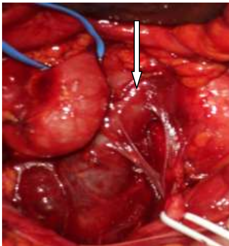
Figure 3 Tapes around the right ureter with the ureter coursing behind the inferior vena cava (arrowed)

The patient made an uneventful recovery and was discharged on post operative day 5. The double-J ureteric stent was removed on postoperative day 32. Postoperative IVU done revealed correction of the anomaly with good drainage.