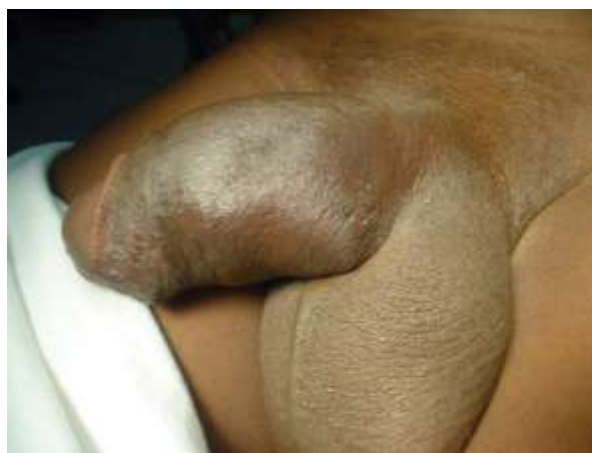
Figure 1 Typical penile deformity in a patient with penile fracture

This study consists of 6 consecutive patients who were admitted to the urology unit of Korle Bu Teaching Hospital between December 2003 and January 2008 with a diagnosis of penile fracture. All the patients gave a clear history of sustaining blunt trauma to the erect penis, hearing a cracking or popping sound, followed by rapid detumescence, sharp penile pain and swelling (Figure 1).