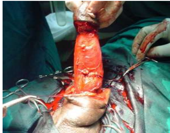
Figure 4 Tunica albuginea tear sutured

The tear in the tunica albuginea was then closed with 3.0 interrupted vicryl sutures (Figure 4).