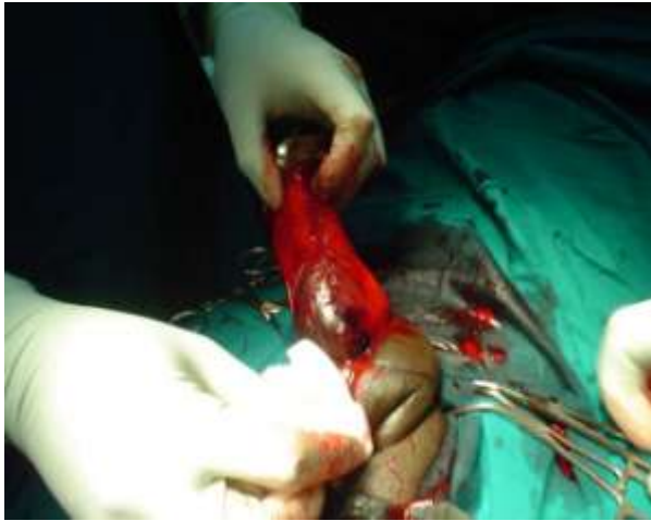
Figure 2 Penis degloved to expose fracture site

All the patients underwent surgery on the day of presentation. The penis was explored through a circular subcoronal incision (Figure 2).