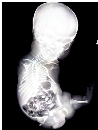
Figure 2 Post-mortem radiological image of the neonate confirming amelia of the upper limbs and right lower limb

The baby was admitted to the neonatal intensive care unit for further resuscitation. The initial evaluation revealed respiratory distress, probably due to meconium aspiration in a neonate with limb deformities. There was no other gross abnormality on examination. Despite resuscitative measures, the neonate died 48 hours after delivery. The mother refused to see the baby in NICU. Informed consent was obtained for a post-mortem radiological evaluation of the baby (Figures 2 and 3). Consent for autopsy, for the evaluation of internal organs was declined.