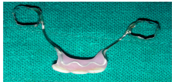
Figure 4 Photograph of appliance before insertion

The treatment plan comprised of thorough oral prophylaxis, placement of pit and fissure sealants, restoration of carious teeth, extraction of root stumps of deciduous teeth, followed by fixed prosthetic replacement of the congenitally missing mandibular teeth was done using acrylic teeth attached to a lingual arch (Figure 4).