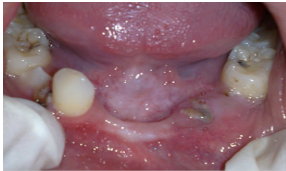
Figure 2 Pre-operative photograph of mandibular arch

Intraoral examination revealed mixed dentition stage, with mesial step molar relationship, root stumps of 52, 61, 62, 73, 84, missing 41, 45, 31, 33 and multiple carious teeth (Figure 2).