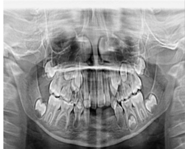
Figure 3 Orthopantomograph of the patient revealing no evidence of development of 31, 32, 33, 41, 42, 45

Karyotyping and Cyto SNP assay were done to detect any chromosomal aberrations responsible for agenesis of the teeth; however no significant findings could be ascertained.