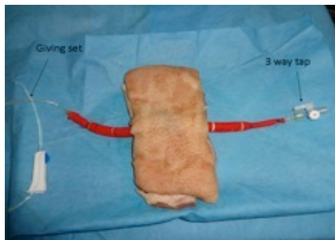
Figure 2 Completed tissue model

-ble to expel air from the system. The giving set is opened, allowing fluid to distend the balloon. Figure 2 shows the setup of the tissue model. Ultrasound gel is placed on the surface of the tissue model and a linear ultrasound probe (12MHz) is placed on the model to identify the “vessel”.