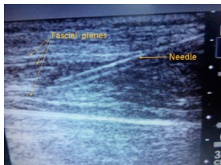
Figure 4 Ultra sound image of tissue with needle in situ