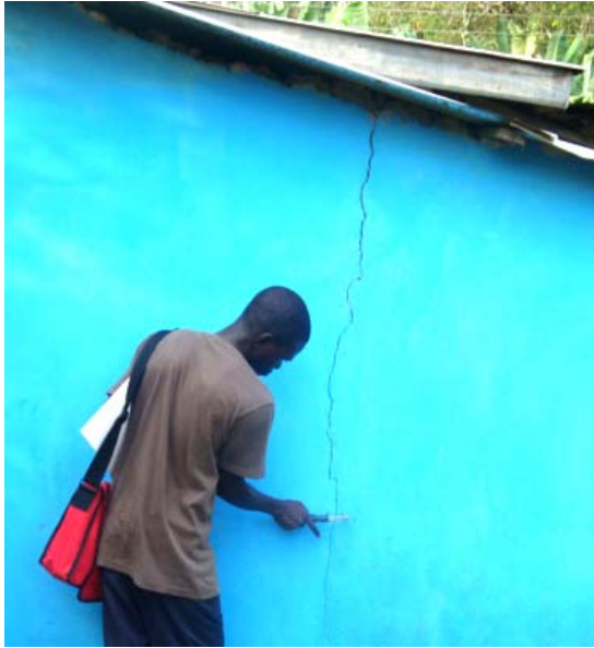
Fig. 1 Crack on a Wattle and Daub Building

Crack Description: Through vertical crack extending from window to apron