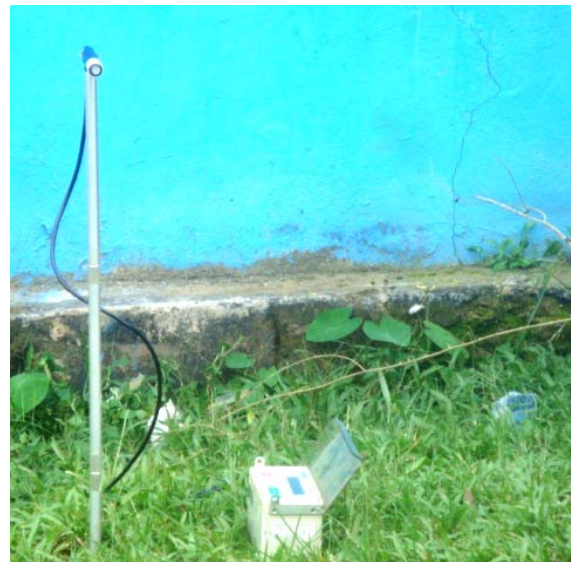
Fig. 2 Set-up for Monitoring of Crack and PPV

The results obtained from various mines between 2002 and 2008 were pooled together and the ranges of values, means and standard deviations were obtained. The results are given in Table 3.