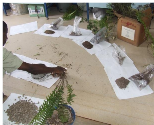
Fig. 3 Soil and Plant Samples under Investigations

Eight different plant species, namely: Colocasia esculenta (Cocoyam), Terminalia superba (Ofram), Leucaena leucocephala (Leucaena), Pityrogramma calomelanos (Fern), Xylopi aethiopica (Hwentia), Musa sapientum (Banana), Chromolaena odorata (Acheampong weed) and Theobroma cacao (Cocoa) were collected from various locations of the rehabilitated sites at AngloGold Ashanti (Iduapriem) mine. Five samples of each plant species including roots, stems and leaves were collected from each location. The samples were placed in labeled bags and transported to the Centre for Scientific and Industrial Research (CSIR) laboratory in Kumasi, Ghana for heavy metal analysis. Similarly, soil samples (3-5 replicates) at 0-20 cm depth from the rhizosphere of each plant species were collected. Fig. 3 shows samples of soil and Pityrogramma calomelanos being prepared for testing in the laboratory.