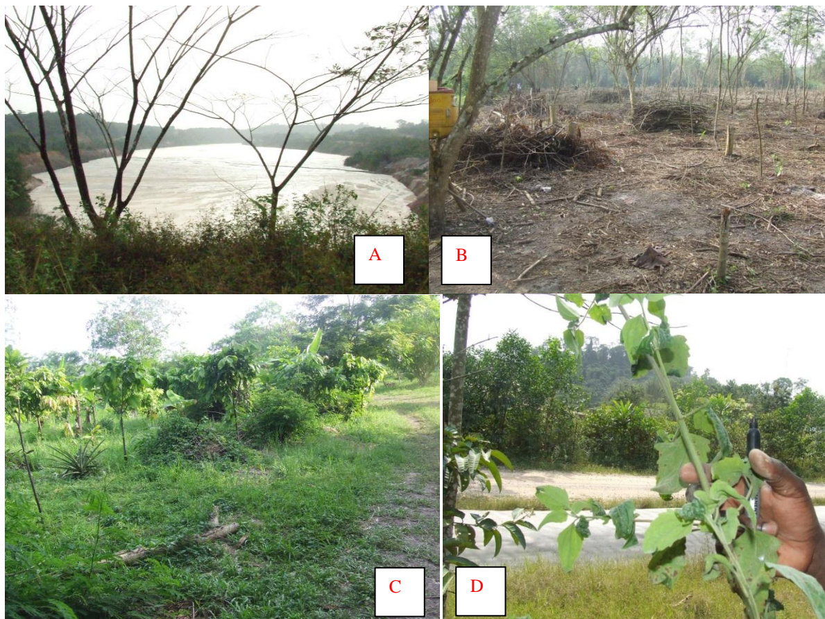
Fig. 2 Reclaimed Tailings Dam: (A) Pre-reclamation Stage, (B) Reclamation Stage, (C) Revegetated Site (at 7 years), and (D) Chromolaena Odorata from the Site