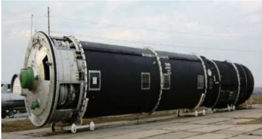
Figure 3: RS-28 Sarmat Intercontinental Ballistic Missile.

Additionally, Russia is simultaneously developing and deploying a huge, diverse and modern set of non-strategic systems that could be armed with either conventional or nuclear weapons (Kristensen and Norris 2012). The exploitation of these non-strategic weapons by Russia could be