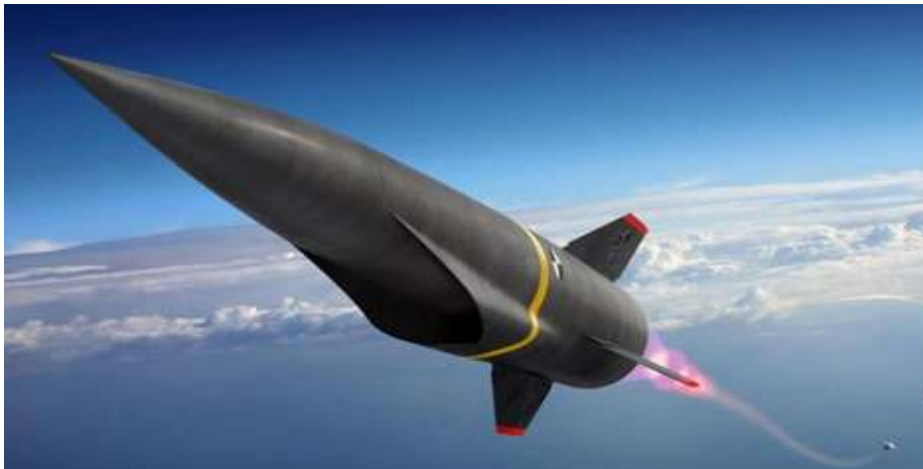
Figure 6: Russian Avangard hypersonic missile in flight.

These missiles include the U-71, Yu-74, BrahMos II and the 3m22 Zircon (Wang, 2016). Additionally, Russia has deployed Kh-47M2 Kinzhal, an operational air ballistic hypersonic missile capable of attaining a speed of Mach 10 and a range of 2,700 km (Mizokami, 2019a). Also, 3K22 Tsirkon (also known as Zircon), a sea and ground launched hypersonic missile with Mach 9 speed and an operational range of about 1,000 km was launched in 2012. In 2018, Russia developed its first and fastest ICBM launched hypersonic glide vehicle, Avangard which can deliver both nuclear and conventional payloads at a speed of Mach 27 (Novichkov 2019). Figure 6 shows a picture of the Russian Avangard hypersonic missile in flight. Other hypersonic missiles produced by the Russian Federation and their features are summarised in Table 1.