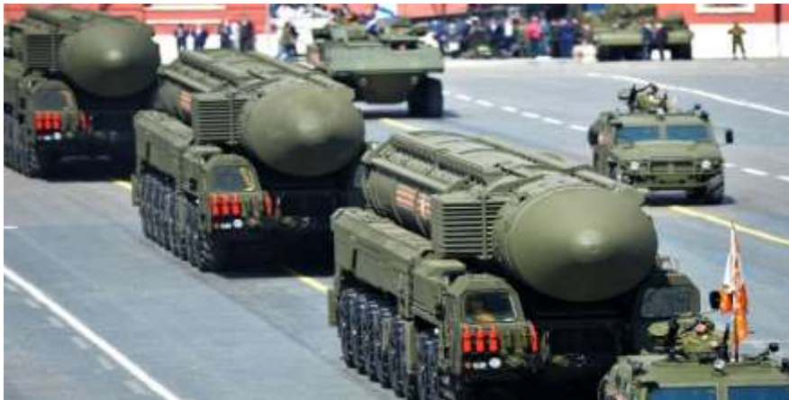
Figure 4: SSC-8 Ground Launched Cruise Missile.

attributed to the fact that these weapons are not accountable under the New START. Figure 4 shows an SSC-8 GLCM (9M729), one of the latest non-strategic nuclear weapons deployed in 2017.