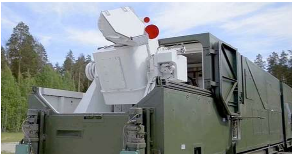
Figure 11: Russian Peresvet anti-satellite laser weapon system.

Russia is considered the foremost space adversary of the USA since from the Cold War era it has a lot of operational space hardware till today. The initial militarisation of space in history was by placing a cannon, the Salyut-3 space station by the USSR. The USA is concerned with Russia's military counter-space program to deny or neutralize US space-based military and commercial satellites (Mizokami, 2019b). Russia is also making efforts to develop GPS jamming technology to be able to interfere with adversaries' space assets on the ground without necessarily going into space. The new technology could also jam and interfere with satellites and their ability to convey messages between terrestrial forces. In the late 2018, Russia deployed Peresvet laser weapon intended to attack enemy satellites as well as to test a ground-based mobile system meant for the destruction of incoming ballistic missiles and satellites (Pickrell 2018). Figure 11 shows a Peresvet laser weapon system unveiled by the Russian Ministry of Defence.