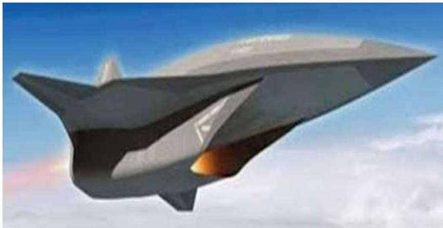
Figure 7: Chinese DF-ZF hypersonic missile.

Pettit 2017). The latter which is shown in Figure 7 is a short to mid-range hypersonic glide vehicle that would be able to fulfil a long term strategic goal by mitigating any potential threat emerging from an adversary carrier groups (Muspratt, 2018).