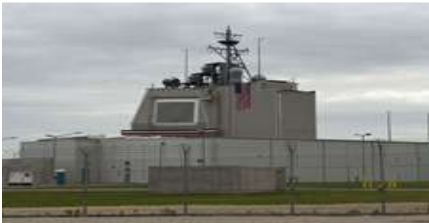
Figure 9: Aegis Ashore Ballistic Missile Defence System

The USA for the past 17 years has dedicated momentous efforts to developing and deploying a layered MDS (Department of Defence, 2019a). These efforts have led to the sustained development in the USA, allied, and partner missile defence performance and affordability. Presently, the USA had established a policy framework, a Missile Defence Review (MDR) that is reactive to new challenges and explore novel approaches to the defensive mission (ibid). The MDR implements a balanced and fused approach to opposing missile threats via a combination of deterrence, active and passive defences as well as attack operations. The current US MDS caters for mid-course and terminal flight missiles threats. Whilst SM-3, Ground Based Interceptor and Aegis ships BMD systems are for mid-course flights, THAAD, PAC-3 and Sea-based Terminal are intended to neutralise enemy's missile on terminal flight (Defence Intelligence Agency 2019). In 2016, a latest version of the US MDS, Aegis Ashore shown in Figure 9 was launched (Williams 2018). The system incorporates a land-based versions of the various components used on Aegis ships. It is intended to serve as a midcourse defence against medium and short range missiles. Table 2 indicates the 21 st Century's MDS of the USA and Russia. Based on the available information, the USA has deployed five MDS in the 21 st Century as against four for Russia.