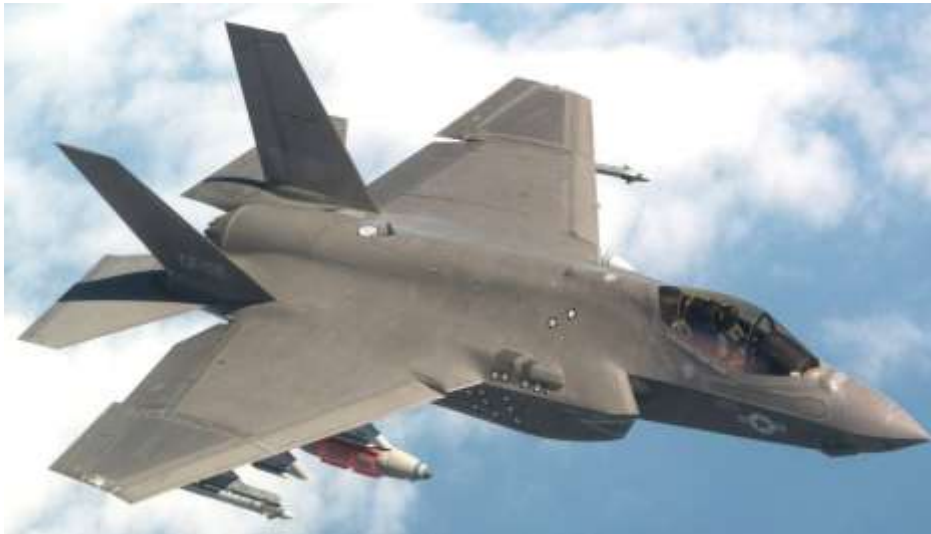
Figure 5: The USA's F-35A aircraft.

respectively (Department of Defence, 2018b). Figure 5 shows a picture of the F-35A aircraft used by the USA for strategic mission.