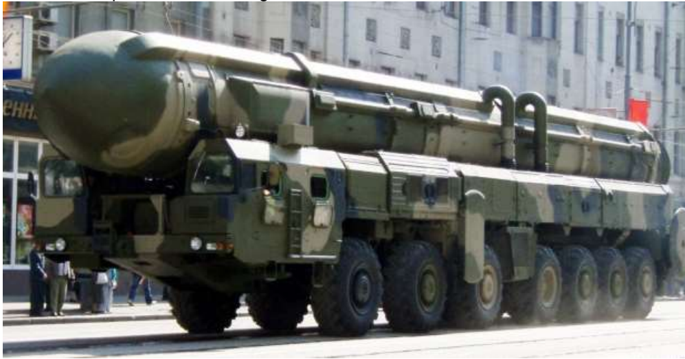
Figure 2: Chinese DF 41 Intercontinental Ballistic Missile.

deployed nuclear-capable precision guided DF-26 IRBM capable of attacking both land and naval targets.