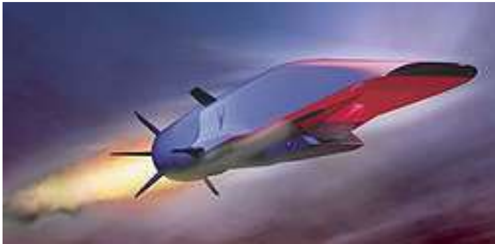
Figure 8: US Boeing X-51 hypersonic missile.

In order for the USA to bridge the existing gap with Russia and China with regards to missile technology, the Pentagon earmarked an average of over $2 billion per year from 2014 in developing hypersonic weapon systems for the US Army, Navy, and Air Force (Thompson 2019). The USA is currently developing a range of advanced hypersonic weapon systems ranging from hypersonic conventional strike weapon to air-launched rapid response weapon (Dolan, Gallagher and Mann 2019). Figure 8 shows a Boeing X-51 hypersonic missile being developed by the USA. Other hypersonic missiles undergoing development in the USA are listed in Table 1.