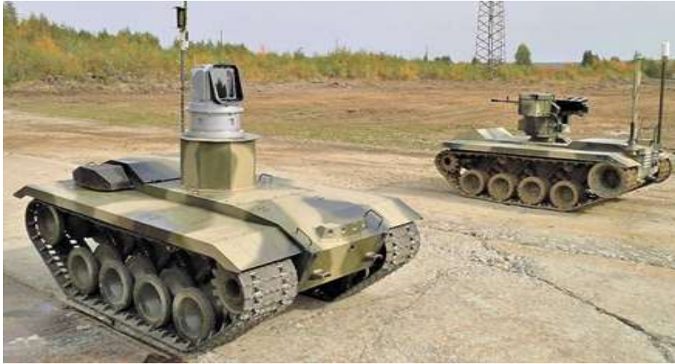
Figure 10: Russian Nerekhta Unmanned Ground Vehicle.

The second area is that of bio-convergence and advanced computing where human beings are network-connected via embedded and worn devices (Rosen, The Arms Race of the 21st Century is About AI, Automation, Beam Weapons, Space, and Force Fields 2018). Genetic engineering tools like Clustered Regularly Interspaced Short Palindromic Repeats (CRISPR) can be weaponised to produce better pathogens, synthetic biology or even transformed gut bacteria that could be conveyed by a chemical weapon to incapacitate human enemy force (Garthwaite 2016). Also, efforts are underway to improve brain implants connected to better reality, DNA-altering technologies in quest to producing a super-soldier, prosthetic limbs and development of exoskeletons to boost soldier's performance in combat (Rosen, The Arms Race of the 21st Century is About AI, Automation, Beam Weapons, Space, and Force Fields 2018). The use of the cyber-warfare is on the increase to ensure human-AI assets are able to combat any new threat whether on the battlefield or in domestic space. Acquiring a cyber-warfare capability is one of the newest must-have for many countries which has generated a cyber-arms race that indicates no sign of slowing down (Mette 2018). Advanced countries are considering the option of cyber weapons along traditional weapons. Generally, cyber-warfare in the 21 st Century is expected to accelerate, become a standard feature of warfare and stealthy cyber-war preparations will continue.