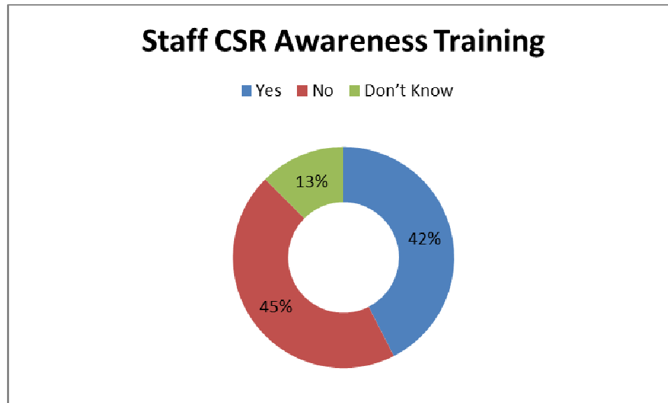
Fig. 4.1:

awareness programme; however, 45 percent claimed they have not attended such programmes and 13 percent were not sure (Figure 4.1).