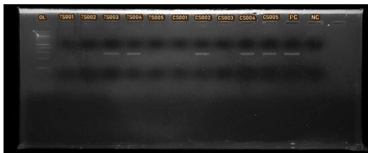
Fig. 2: Agarose gel image showing amplification of E. coli target DNA. Expected band size was 256 bp. DL represents a 100 bp ladder; PC and NC are positive and negative controls respectively. Samples TS003, TS004, CS002, CS004 and CS005 were positive.

type and the presence of E. coli (Fisher's Exact test; p-value = 1.000)