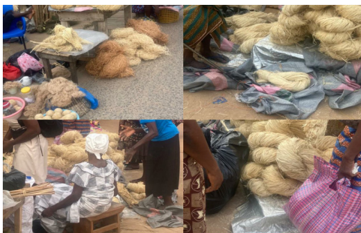
Fig. 1: Chewing sponges sold at Agboghloshie in Accra

These pose a likely health hazard since chewing sticks and sponges are purchased and used for oral hygiene with no prior cleaning and treatment, justifying the need to investigate if there are any microbial contaminants that can affect overall health. This information will support the need for proper methods for storage and handling of chewing sticks and sponges. This study aims to assess the presence of selected diarrhoeal pathogens ( Rotavirus A , E. coli , Salmonella and V. cholerae ) on chewing sticks and chewing sponges sold as ready-to-use teeth cleaning agents on the Ghanaian market.