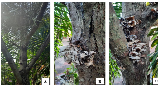
Fig. 3a-c: Photograph of the mushroom on the host plant under very dry conditions 10-12 days after the rain (x1/3)