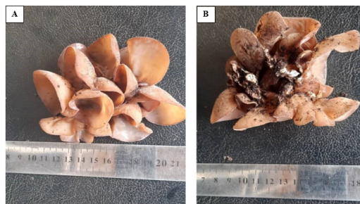
Fig. 2a and b: Photograph of Auricularia auricula-judae (front portion) and backside with short stipe.