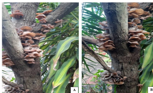
Fig. 1a and b: Photograph showing the fruiting basidiomata growing on the pencil cactus Euphorbia tirucalli L. among other plants after heavy rains (x1/3)

Table 1 shows the occurrence of Auricularia species in Africa. These include A. auricula-judae , A. delicata , A. fuscococcinea , A. mesenterica , A. polytricha and A. tenuis . There is a preponderance of A. auricula-judae over the other species in Africa (Table 1).