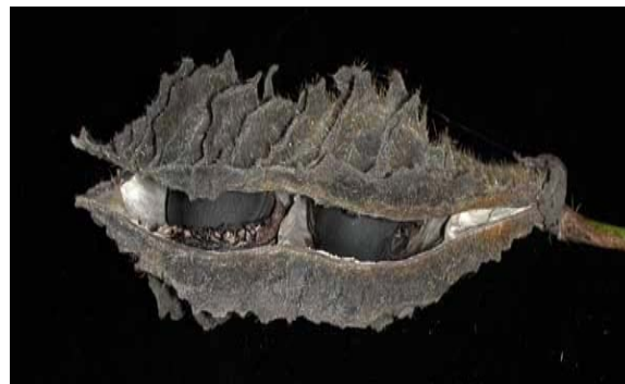
Fig.3: mucona sloanei pod