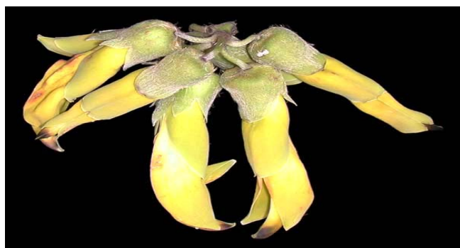
Fig.2: mucona sloanei flower