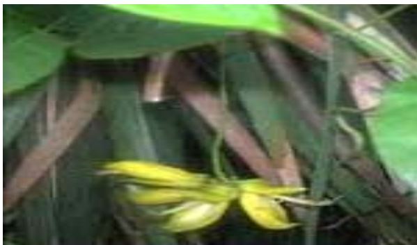
Fig.1:mucona sloanei plant