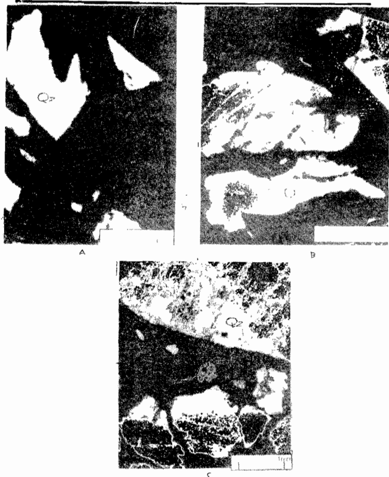
Plate 1. Photomicrographs of Ironstone Samples from Ania-Ohafia Area.

(a) 500 m NE of Ndi Uduma Awoke (b) Ugwu-Eziukwu Akanu