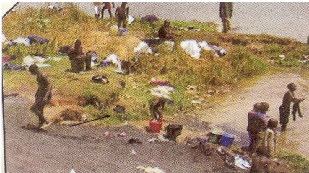
Fig 1: Discarded mine tailings on the flood plain of River Kassa and use of water for domestic activities