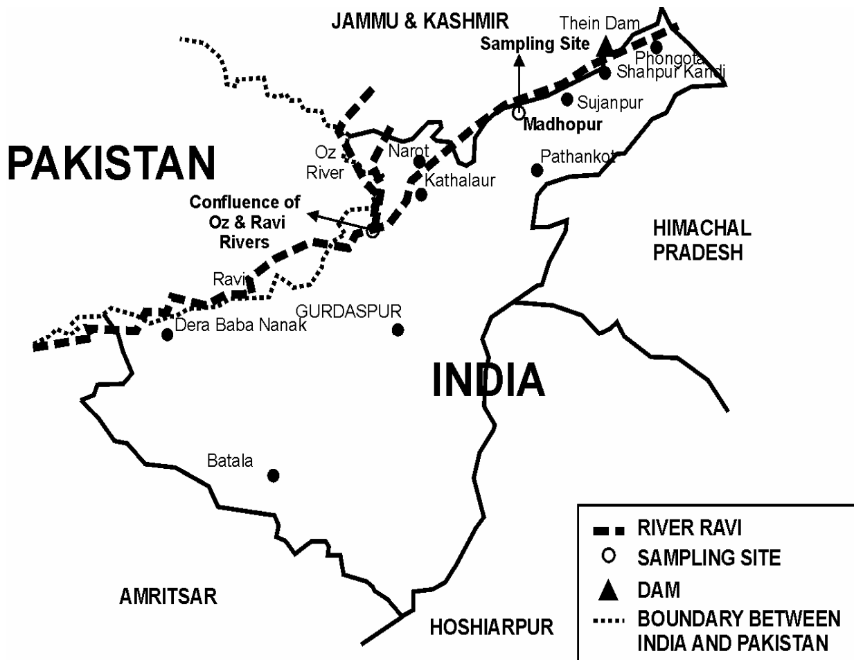
Figure 1: River Ravi showing sampling site