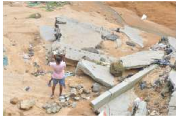
Fig. 6b: Collapsed urban infrastructures in reclaimed wetlands, Atimbo