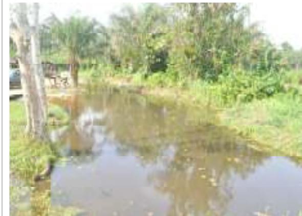
Fig 5a: A natural undisturbed wetland at Akai Efa along Calabar - Ekang