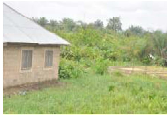
Fig. 4b: Buildings in wetlands usually occupy space and display ecosystem that aids natural waste water management (see this example in Anantigha Wetland)