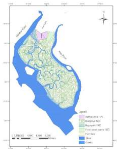
Fig 3b: Calabar showing the two major drains – Calabar and Kwa Rivers

Starting as a fishing settlement along the Calabar River where the Portuguese explorers