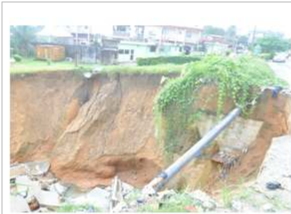
Fig. 6a: Collapsed urban infrastructures in reclaimed wetlands along Atimbo Road