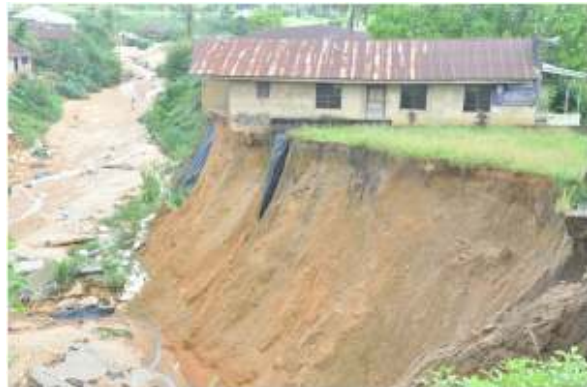
Fig. 7b: Buildings balancing precariously on the sides of a ravine created by collapsing wetland soils that have been exposed to excessive superimposed loads