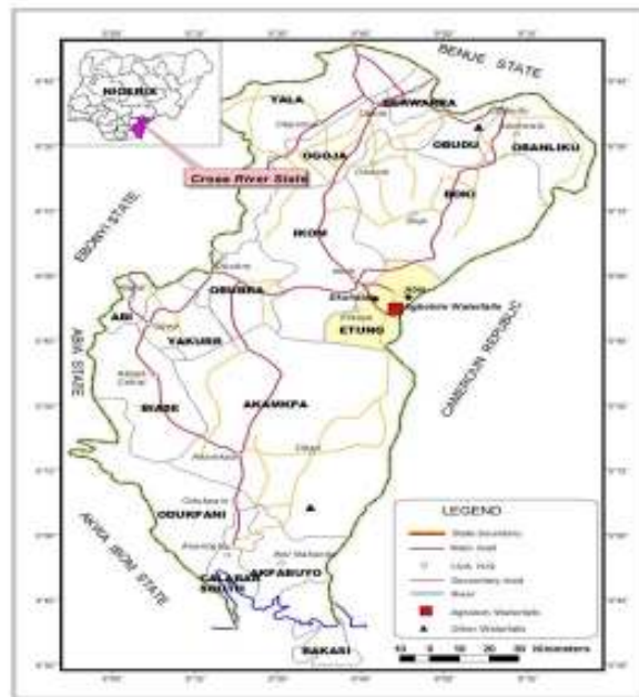
Fig 3a: Map of Cross River State showing Calabar close to the Cross River Estuary