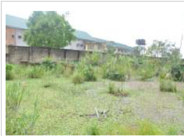
Fig. 4a: Building developments in wetlands with pools of stagnant water trapped immediately outside the fence of a compound at Anantigha, Calabar South LG. Headquarters