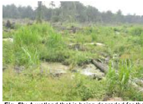
Fig. 5b: A wetland that is being degraded for the purpose of physical development along Atimbo Road