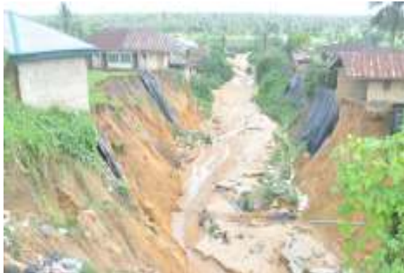
Fig. 7a: Buildings balancing precariously on the sides of a ravine created by collapsing wetland soils that have been exposed to excessive superimposed loads at Atimbo Road