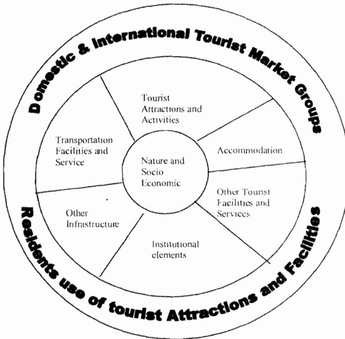
Figure 2: Components of Tourism

needs. Conceptualising the definition, Foster (1985) saw tourism as an activity involving a complex mixture of material and psychological elements. The material ones are accommodation, transportation, the attractions and entertainments available at the destinations. The psychological factors include a wide spectrum of attitudes and expectations ranging from pure escapism to fulfilment of a dream or fantasy, or rest, recreation, educational and other social interests. From the foregone definitions, the components of tourism and their inter-relationships, which are basic to tourism planning and development, are illustrated in Figure 2 below.