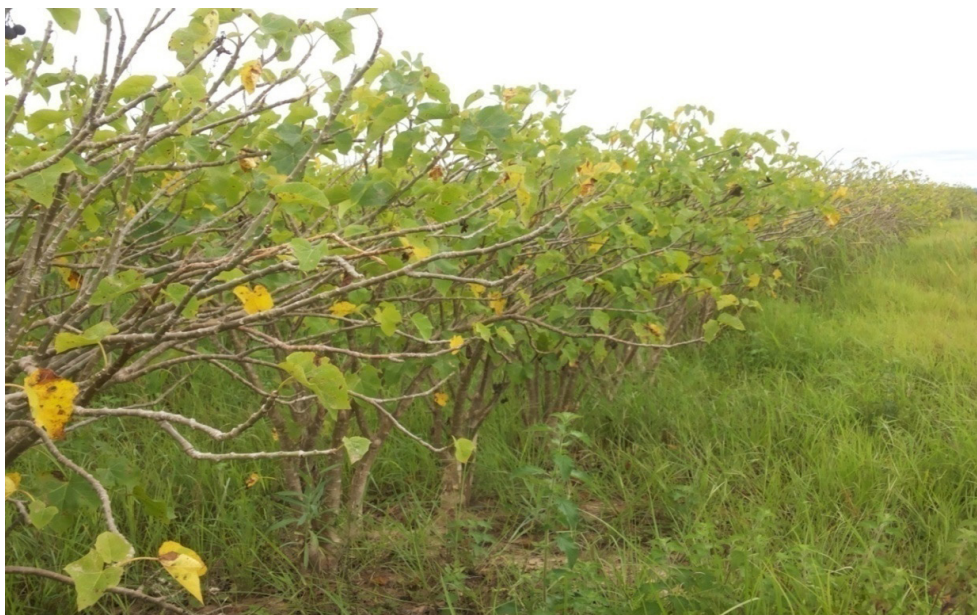
Figure 2: Jatropha plantations at Kpachaa.

spent all day to obtain a bucketful of water. The constructions of the boreholes therefore have been highly commendable because it shortened time spent for water. However, responses from younger citizens of the town, have been more modest and recognize the negative impact of the projects. The lack of a shea nut industry in the community compared with neighboring villages was raised by the youth. A young man, in his early thirties wondered “ why are other communities doing so well in the shea trade and not ours ”. The women differed in their responses to similar questions. The elderly women attributed the lack of the crop to population increases. A young woman in a somber tone pointed out that shea use to be collected ‘ over there ’, pointing her index finger towards the cleared fields of the jatropha plantations. The clinic stopped functioning when the company suspended activities. The corn-mill, a diesel operated equipment is no longer patronized. Respondents opined that a newly installed corn mill in the town of Jemile (6 kilometers away) is powered by the national electricity grid and was therefore more efficient.