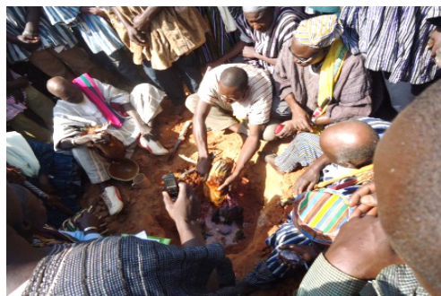
Plate 3: Slaughtering the animals for the blood to be buried