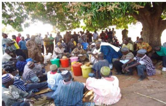
Plate 2: Inspection of the items by the leaders of the two factions