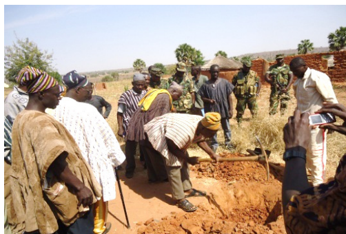
Plate 1: Regional minister with his security guards at the pit digging site