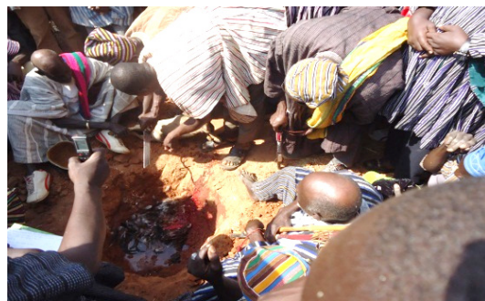
Plate 4: Pacifying the gods after slaughtering the animals