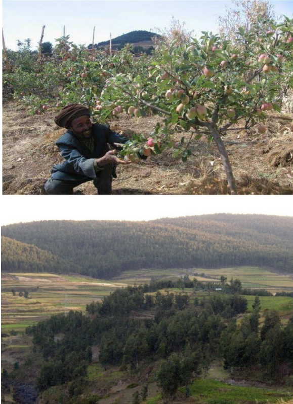
Figure 2: Highland apple (left) and Eucalyptus tree forest on the degraded and marginal lands (right)

along the main road that connects Gondar and Wollo over impressive mountain ridges and highland plateaus.