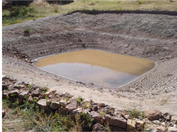
Figure 4: Water harvesting scheme constructed at household level

As observed in the field, beneficiaries were forced to construct ponds without creating awareness, consequently the few ponds constructed were not sustainable and were poor in quality. In this regard, one key informant from Woina-Dega zone shared his experience in the following ways: