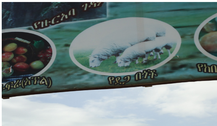
Figure 3: Rearing improved sheep in Dega agro-ecological zone