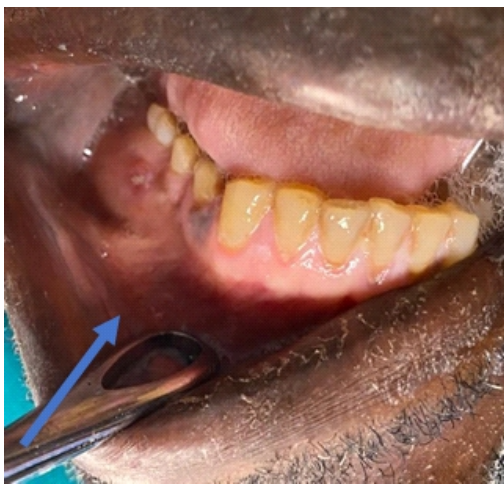
Figure 1(b): Parulis and buccal abscess associated with lower right 1st molar tooth.