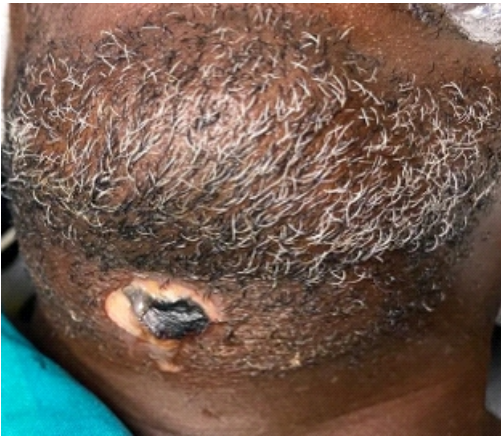
Figure 1(a): Submandibular swelling with region of fasciitis