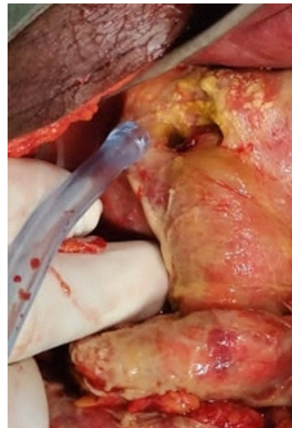
Figure 3: Perforated duodenal ulcer

With routine laparotomy procedures, intraoperative exploration revealed a perforation of about 15mm in its widest diameter in the duodenal region (Figure 3). This was repaired with a modified Graham's patch. The repair seal was tested by submerging the site under normal saline and injecting air into a nasogastric tube, indicating the absence of bubbles. Standard closure, cleaning, and dressing were done. While maintaining a strict sterile barrier, routine cleaning of the mouth and face was done, and a thorough examination was completed. Extraction of the offending tooth (lower right first molar) and a retained root of upper left first molar were done. Debridement was made with abscess drainage and copious irrigation using 50% hydrogen peroxide and Savlon preparations. Hemostasis was secured, and dressing was done.