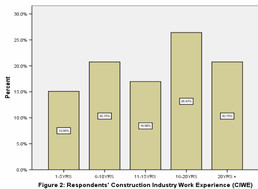
Figure 2: Respondents' Construction Industry Work Experience (CIWE)

About 15.09% of the respondents have less than five years experience working in the construction industry. Majority of the respondents (28.42%) however, have had cumulative construction industry work experience in the range 16 – 20years. Those whose experience spans more than 20years account for 20.79% of the respondents showing good representation of the older professionals in the research (see figure 2). Majority (47.2%) of the respondents were quantity surveyors. The historic growth of the QS profession is inextricably linked to the traditional procurement system which has as its heart BOQ (Birnie et al, 1996). BOQ preparation is a role many professionals would readily concede to the QS. 20.75% of the respondents were builders, 16.98% were architects, 9.43% of the respondents were civil engineers, while the rest (5.66%) were mechanical and electrical engineers (see figure 3).