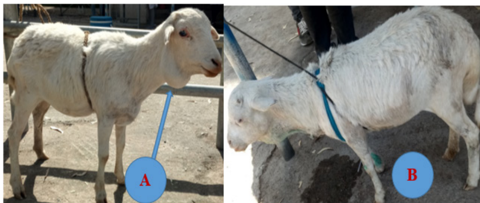
Figure 1. Picture of the sheep affected by caseous lymphadenitis (A) and after therapy (B).

During clinical examination, the sheep displayed symptoms such as loss of appetite, coughing, general ill health, purulent nasal discharge, fever, and increased respiratory rate. Additionally, there was enlargement of subcutaneous tissues and lymph nodes around the neck region, and a hot, fluctuating, sickle-shaped, and enlarged swelling (Figure 1) was observed. Aspiration of this swollen mass with a sterile 20-gauge needle and syringe revealed thick, pale green, watery to cheesy pus, which confirmed the presence of a pus-filled cyst around the neck region. The EDDIE App-based diagnosis revealed the case as CLA and its treatment options. Therefore, based on the history of a wound, characteristic clinical signs, and EDDIE App-based diagnosis result, the case was tentatively diagnosed as CLA, which is differentially diagnosed with localized tumor (lymphoma), abscess oedema, and haematoma.