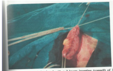
Fig. 4: Closure of the stomach with a 2-layered inverting (Connell) of 3.0 chromic catgut