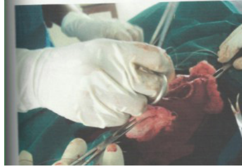
Fig. 2: Removal of an elliptical portion of the tissue of the stomach to expose its contents