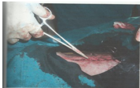
Figs. 5a & 5b: Placement of interrupted horizontal mattress sutures in the upper flap to create an overlap