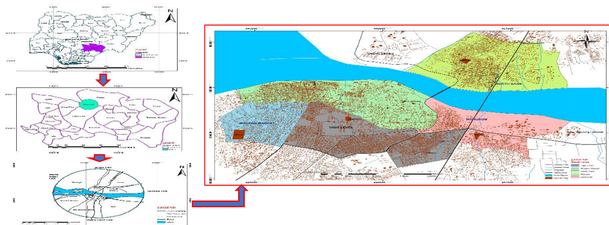
Figure 1: Location of Makurdi

small-scale animal husbandry, with others ranging from white collar-jobs to handcrafts and trading.