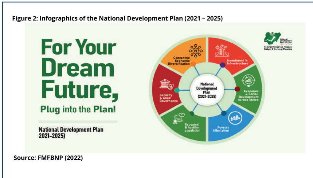
Figure 2: Infographics of the National Development Plan (2021 – 2025)

The NDP 2021-2025, characterized by an integrated and multi-sectoral development approach, holds immense potential, to achieve an average economic growth of 4.6 percent, elevate 35 million people from poverty, and create 21 million full-time jobs by 2025 (FMFBNP, 2022). In pursuit of national development, various MDAs operate across different sectors, each playing a pivotal role in Nigeria's comprehensive development. A crucial aspect of realizing these ambitious targets is a well-structured PMS. This system precisely delineates how the goals and efforts of each MDA interconnect, contributing to broader national objectives.