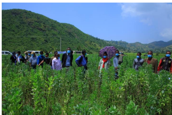
Figure 4. Faba bean cluster in Farta and Ebenat woredas

This is partly in agreement with Kissi and Tamiru (2016) who reported that the highest agronomic traits and dry biomass yield were recorded by the row planting method as compared to broadcast planting. The highest number of seeds per pod from Hachalu (4.4) coincided with farmers' speculation that Hachalu is the best variety with more seeds per plant, and is more productive than the other two varieties. This can be seen in harmony with the reports of Ashenafi and Mekuria (2015) and Degife and Kiya (2017) which portray that the number of seeds per pod had a considerable relationship with seed/grain yield.