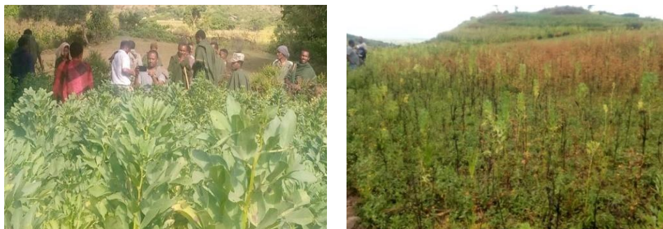
Figure 3. Improved variety (left) and local variety (right) in Libokemkem

Three field visits were organized by the kebele agricultural development offices in Ebenat and Farta, where over 80 (66 men and 14 women) and 120 farmers (101 men and 19 women) participated, respectively. In Libokemkem, over 70 farmers (59 men and 11 women) participated in three similar field visits. Figure 4 shows one of the field visits in Farta and Ebenat.