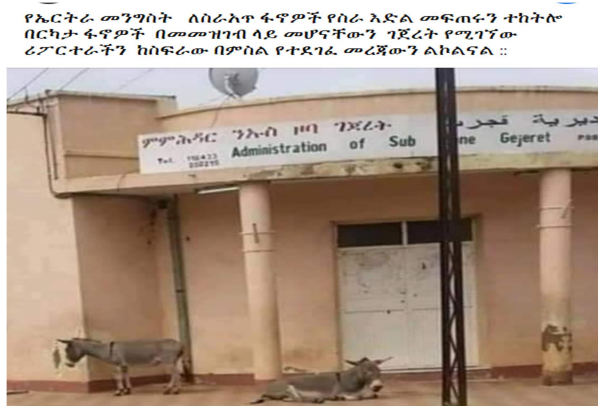
Figure 1: Portraying Fano as Donkey