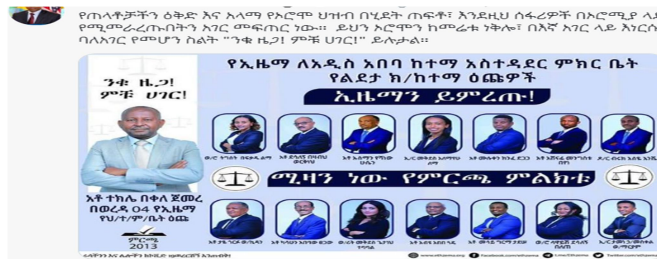
Figure 5: Enemification during the 2021 Election

Figure 3, which are found to be photo-shopped, with added captions in Amharic which is translated as ‘Register! The clear robbery of the Oromuma has been evident to all concerned. Since its establishment, Nech-sar National Park in Gamo Zone in southern Ethiopia, tourism...!’ In the post, the source accuses the Oromos as if they seized the land of Southern Nations, Nationalities and People’s Region (SNNPR). The source of the post put a wrong caption to an Oromo politician standing in Borena National Park as if the site is in Nech-Sar National Park, which is managed by the SNNPR. This picture also reminds us that hate speech is partly achieved through disinformation by twisting realities. The Amharic caption, which is added by the one who edited the original photo, reads ‘not only the Earth, the sky is also ours’ which implies having insatiable desire to grab everything they come across. Figure 4, on the other hand, is an instance of accusation against ethnic Amhara by portraying them as people grabbing/invading Oromos’ land in the name of establishing churches and calls on ethnic Oromos to be cautious of what he labeled as ‘the invading Amharas’. In addition, Figure 5 below which illustrates how targets are portrayed as potential land grabbers is captioned, ‘Our adversary's intention is to systematically eradicate ethnic Oromos and give the land to the settlers. They called the technique of evicting the indigenous Oromos and replacing by the invaders 'alerting citizen.’