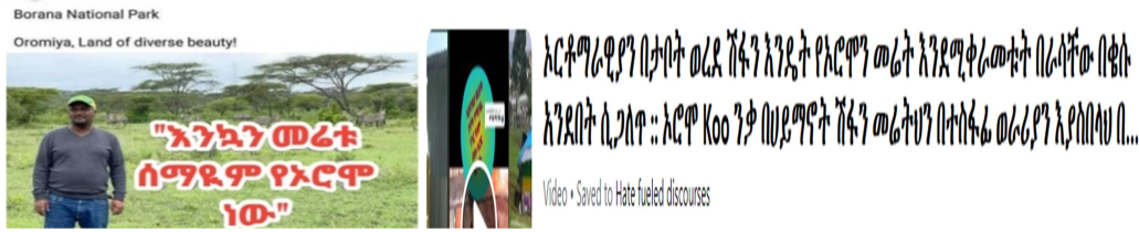
Figure 3: Accusation against ethnic Oromos Figure 4: Accusation against ethnic Amharas: https://encrypted-tbn0.gstatic.com/images?q=tbn:AND9GcTNhRSIM

Source: https://www.facebook.com/watch/?ref=saved&v=357017799188991mZpJIHTmualY7dnGVf6ZUXXCBAQ3zEHdU_QV_FZ6iCpCuPLy9FR9wEbFKd2Q6s&usqp=CAU