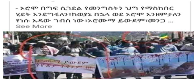
Figure 6: Interpretation in Hate Speech

There is also role of interpretation in which a hate speech is extrapolated as call for measure. In Figure 6, for example, demonstrators are seen holding a banner which reads ‘let Oromuma 60 be destroyed’, to which an apparently ethnic Oromo social media user assigned additional meaning beyond what is visible in the banner. This seems part of the art of fueling hatred by evoking stronger emotions.