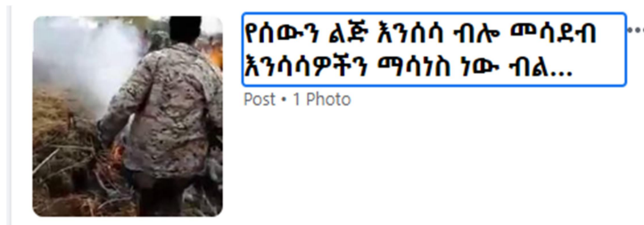
Figure 2: Allegedly burning victims alive

In the same vein, some of the dataset's contents demonstrate how ethnic Oromos are referred to as "cattle" and "herd," as well as other analogous hateful expressions like "groups with no mind to think with". There were also ways in which the ethnic groups were portrayed to be sub-human. Figure 2 shows an unidentified person being allegedly burnt alive by an armed man.