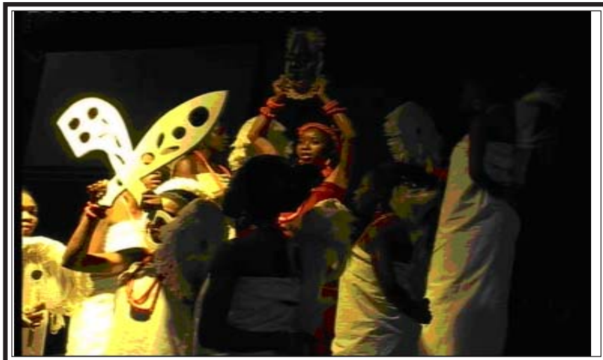
The mask carrier on red ugbegbe (velvet) at the middle with the isekhien women on white wrapper tied on their chests