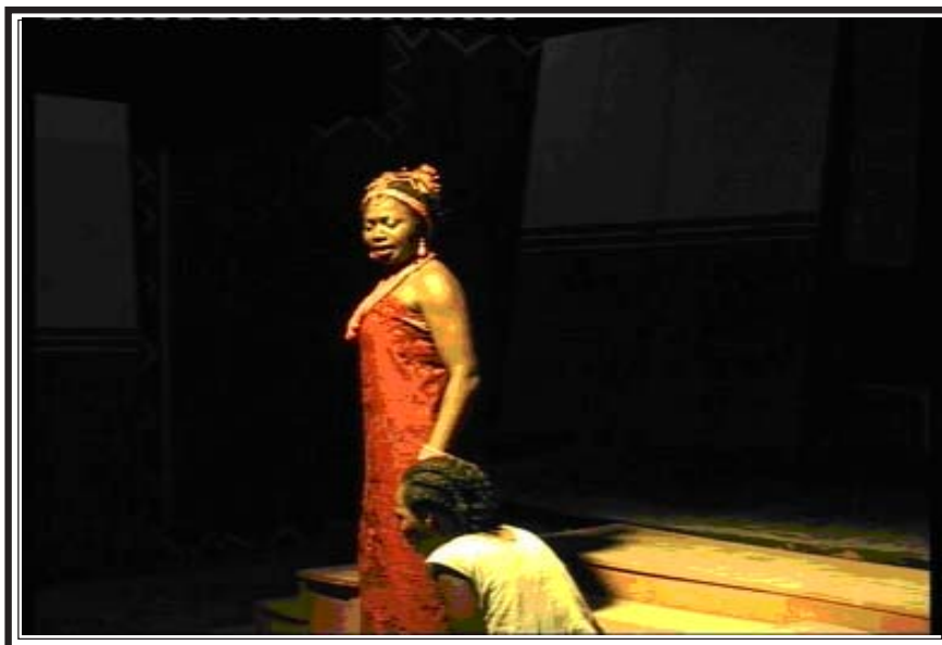
Queen Mother on red ugbegbe and her slave on milk shirt and skirt