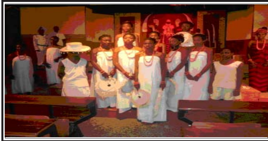
On the left is uke, the isekhien women and Queen Idia's maid

The dominant colours used for the performance is white and red designed with a contemporary approach. The colours are a reflection on the Benin culture.