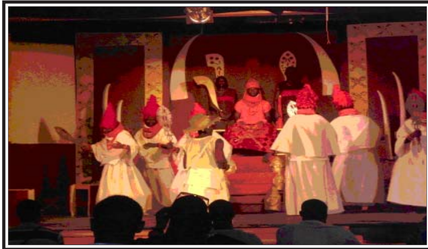
The Oba and his chiefs on ceremonial attires