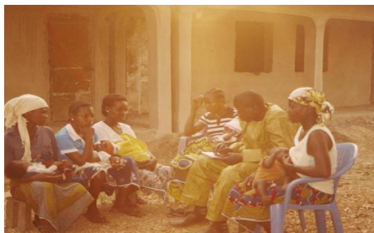
Plate 2: FGD with women who delivered babies in clinics during follow up

The above re-echoes the strength of the TfD process in giving inspiration to communal life by providing the means through which issues affecting the people's lives are explored and addressed. It offers a means of reflecting why and how changes might be necessary and can come about. This is why TfD practitioners seek to create or do theatre with the people so as to encourage collective decisions from the people that can change their realities. In both communities, there was low knowledge regarding the issue of mother to child transmission (MTCT) prior to the drama performance. The communities had not heard of it before this time. The activist aided by the local health providers enlightened the people on the risks and suggested where to get help. This led to the discussion of HIV/AIDS on a large scale. Discussions bordered on safer sex practice, as well as how to avoid risky behaviour, including discussions on the use of condoms as well as other contraceptives with a practical demonstration on how to use a condom.