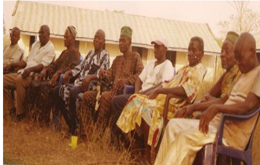
Plate 1: Cross section of elders at Ikyaan during workshop

An interesting event to buttress the importance of clinic based delivery occurred on day one at Amua. As the drama activists arrived and were moving to the residence of the traditional head; a lady who was pregnant and in labour literally delivered her child in a wheel barrow. Enquiries revealed that it was her third pregnancy and she has not attended antenatal clinic because she normally delivers at home without complications and when the labour pangs began, she had no one to help her. This was used as an illustration by the activists to further drive home the message of clinic based delivery and planning for pregnancy. During discussion of the need for planning pregnancy at plenary, a man at Ikyaan community had this to say: